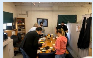
Pre-gaming Thanksgiving with... breakfast..